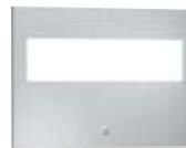
Toilet Seat Cover Dispensers