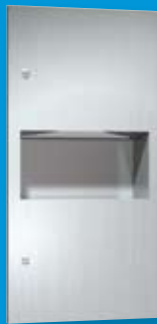
Paper Towel Dispensers