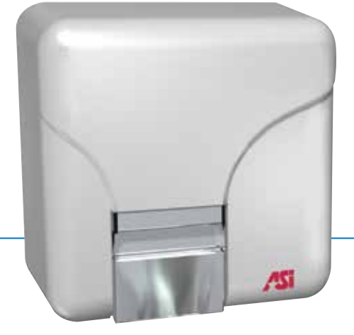
Decibel Level 60 dB-A @ 2M

11\frac{3}{8} " x 11\frac{7}{32} " x 3\frac{7}{8} " (289 x 285 x 100 mm) (Conforms to ADA)