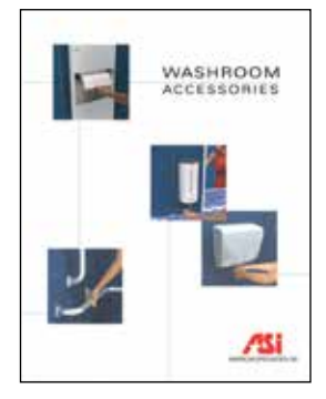
americanspecialties.com for our complete line of washroom accessories

American Specialties, Inc., Global Partitions, Accurate Partitions Corp. and ASI Storage Solutions are all part of the ASI Group of companies.