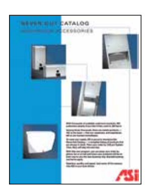
Never Out Catalog