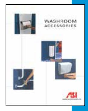
Visit americanspecialties.com for our complete line of washroom accessories