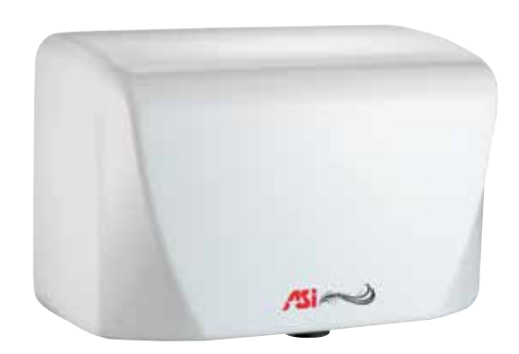
Decibel Level 69 dB-A @ 2M